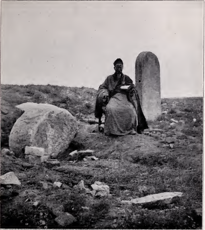
YÜ SHOW, THE CHINESE HIGH PRIEST.